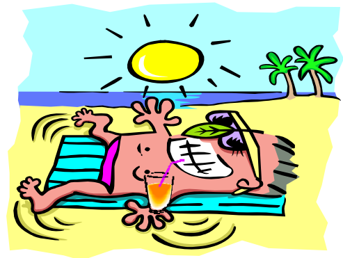
Stan sips & tans.