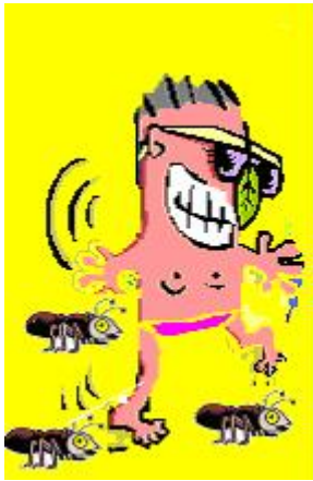
It's ants in Stan's pants!!